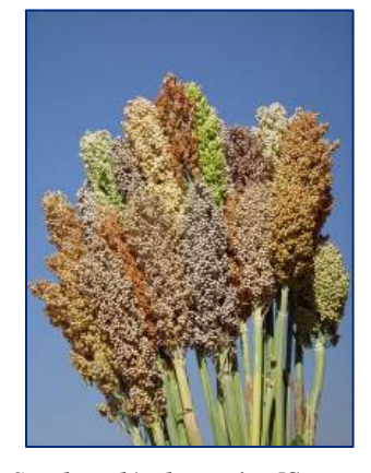
Figure 1: Sorghum bicolor grains

During the past years sweet sorghum (scientific name: Sorghum bicolor L. Moench) has gained considerable interest as a source of either fermentable free sugars or lignocellulosic feedstock with the potential to produce fuel, food, feed and a variety of other products in various combinations thereby reconciling energy and food security issues [3]. Sweet sorghum is considered one of the most efficient crops to convert atmospheric CO_2 into sugar with large advantages compared to sugarcane production in some areas of the tropics, making it a promising crop for bioenergy while meeting food and fodder needs.