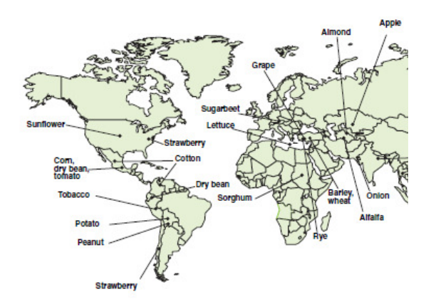
Figure 2: Centres of origin of selected crops [7]

Originated from Africa (see Figure 2), today sweet sorghum is cultivated in semi-arid to humid climates in several African countries, India, Southeast Asia, the USA and Europe.