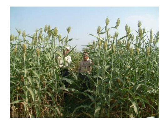
Figure 9: Productive genotypes under drought (midseason stress)