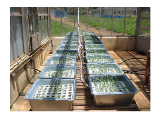
Figure 12: Identification of Al-tolerant sweet sorghum genotypes

During the 2009/2010 growing season breeding activities launched by EMBRAPA at testing sites in Brazil address the evaluation of sweet sorghum varieties with respect to improved aluminium tolerance (see Figure 12) and to increased lignocellulose yield (Figure 13).